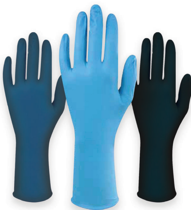
ENVO-8 OPTIFY GLOVE KODA