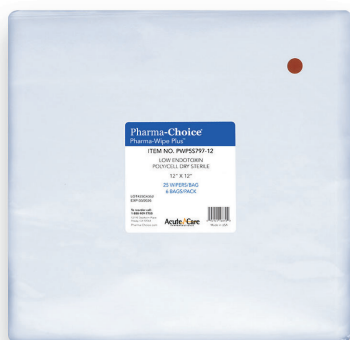
Pharma-Wipe 12"x 12" Sterile