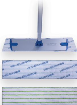
Sphergo Swivel & VCDCS Cleaning Pad