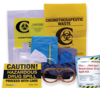
Chemo/HD Spill Kit