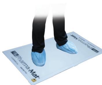
Pharma-Tacky Mat Refill *with frame