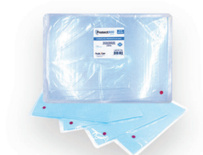
Pharma-Chemo Mats (Sterile)