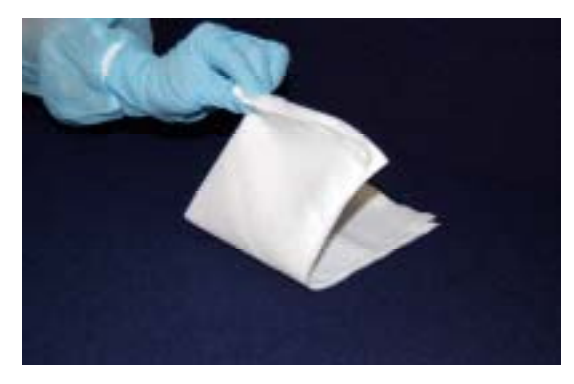
Step 2 : Fold the wiper in half again, creating a four thickness 4\frac{1}{2} " x 4\frac{1}{2} "