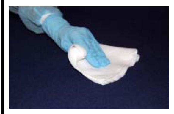
Step 4: Wipe once, turn it over and wipe again.

Step 3 : Wipe once from the cleanest to the dirtiest area, turn it over and wipe again. Unfold and refold so that the two contaminated sides are together. The result is a four thickness 4\frac{1}{2} " x 4\frac{1}{2} " with two clean outer sides exposed and two contaminated sides touching on the inside of the wiper.