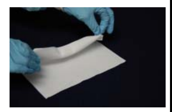
Step 5 : Unfold the wiper completely and repeat Step 1, ensuring the contaminated sides meet on the initial fold. Repeat Steps 2, 3 & 4.